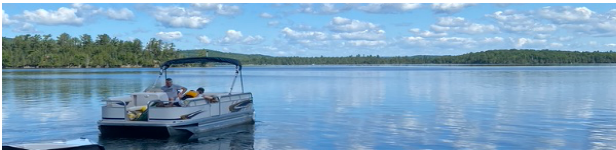
Figure 1 Setting off to mark the milfoil beds with yellow buoys.

The yellow buoys also give residents and cottagers a better idea of the extent of our milfoil problem; and helps the Association monitor the movement and proliferation of this invasive species. We are grateful to our teams of volunteers* for the many hours they put in each year to carefully install, reposition and remove these protective markers on our watershed.