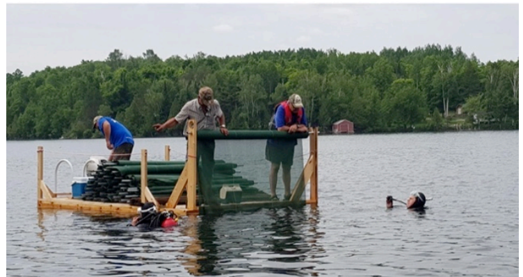
Deploying synthetic tarps over Eurasian milfoil in Little Cedar Lake.