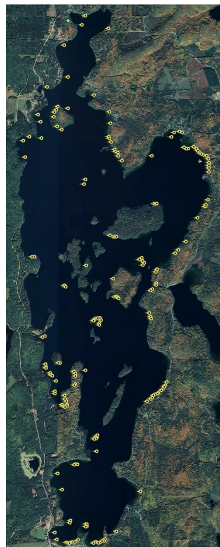
Yellow Buoys on Blue Sea Lake

The Board is continuing to evaluate whether it will be possible to hold the 2020 Annual General Meeting at the Municipal Hall in Messines on